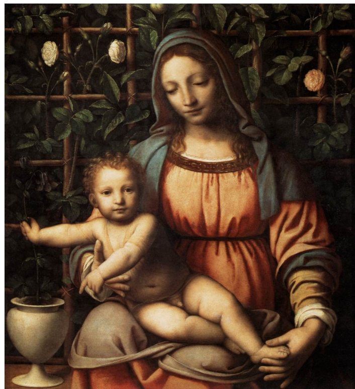
fig 7: Madonna in the rose garden by Bernardino Luini