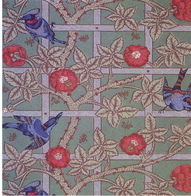
fig 8: rose trellis by Willam Morris

William morris has influenced today british culture, primarily in wallpaper design although his floral ideas still live on in what can be considered both modern and traditional styles. The floral aspect has slowly evolved over time to created what can only be considered as traditional geometric wallpaper patterns which are still commonly used today so you could say that willam morris influence a whole style of wallpaper currently used today with this initial idea beginning with a rose.