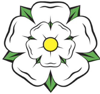
fig 12: The yorkshire rose