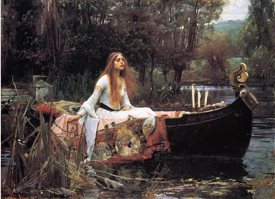
fig 10: The lady of shallot by J.W.Waterhouse

British Art has influenced the way in which we see the world, how we decode the art gives an influence to how we perceive the things around us in this case we see a woman smell a rose and we automatically associate the rose with the woman and the femininity the same can be said for Sandro botticelli painting "The birth of venus" as well as Bernardino Luini and Stephen Lochner who painted roses around the Virgin mary.they all have a female figure as the main focal point of the art. Religion and Greek mythology (origins) feeding into forming an idea of how we see the rose today.