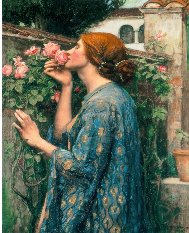
fig 9: The soul of the rose By J.W.Waterhouse