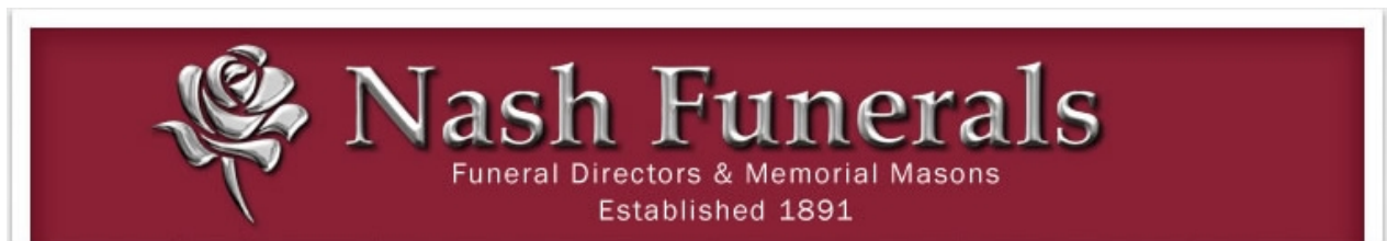
fig 3: Nash funerals

The use of the roses logos within Britain normal represent the war of the roses (mainly the tudor rose)(see fig 4 and 5) due to that aspect being the main culturally unique aspect with Britain other aspects of logos in Britain cannot be considered to be unique to Britain as the meanings of love and religion are generally universal.